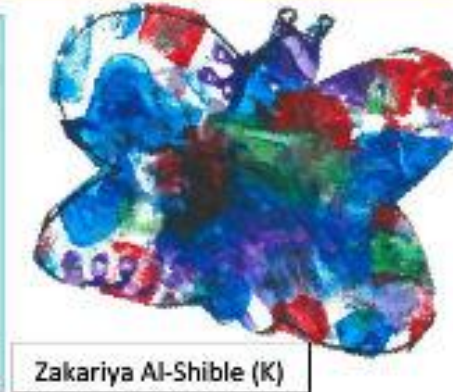
Zakariya Al-Shible (K)