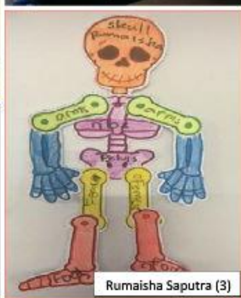
Rumaisha Saputra (3)