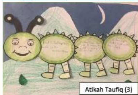
Atikah Taufiq (3)