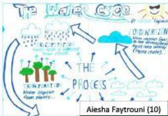
Aiesha Faytrouni (10)