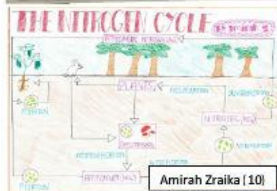
Amirah Zraika (10)