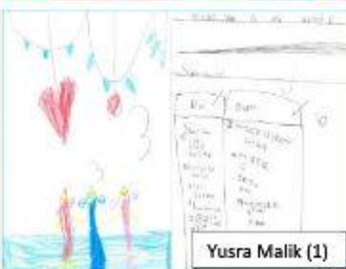
Yusra Malik (1)