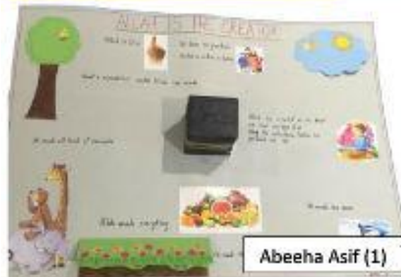
Abeeha Asif (1)