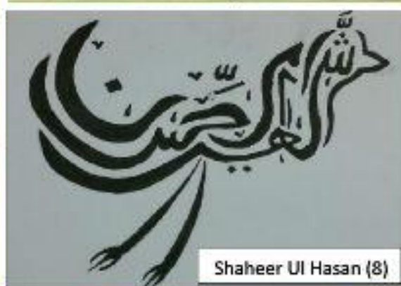
Shaheer Ul Hasan (8)