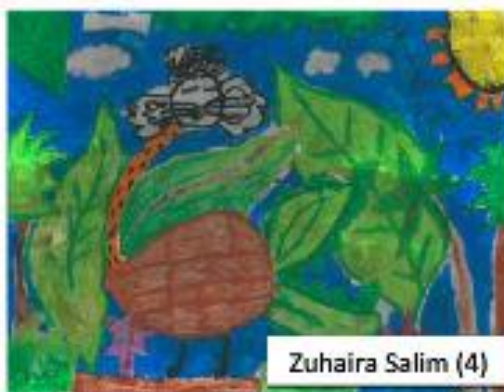
Zuhaira Salim (4)