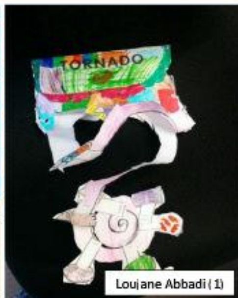
Loujane Abbadi (1)