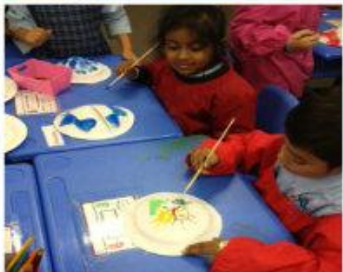
Making an umbrella after a busy week of learning the letter Uu (kindergarten)

Our focus unit for this term is 'Under the Sea' for English. We have read many factual books and narrative stories about sea creatures and life under the sea. Kindergarteners have also started their News presentations in week 3. Their first topic was based on their favourite sea creature. Students loved to be the centre of attention when it came to their turn at presenting their news to the class. To further bring this unit to life, students have been creating different sea creatures during their Arts and Craft lesson.