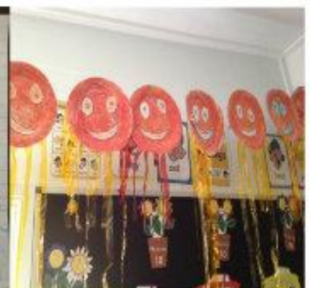
Octopuses made by Kindy kids