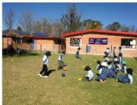
Kindergarten showing their skills at AFL